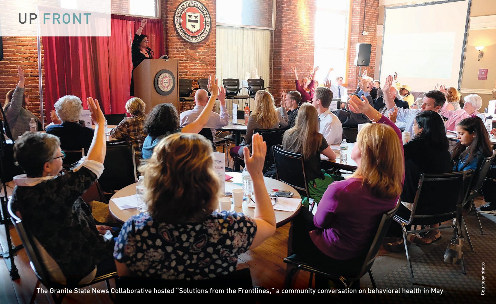
The Granite State News Collaborative hosted "Solutions from the Frontlines," a community conversation on behavioral health in May