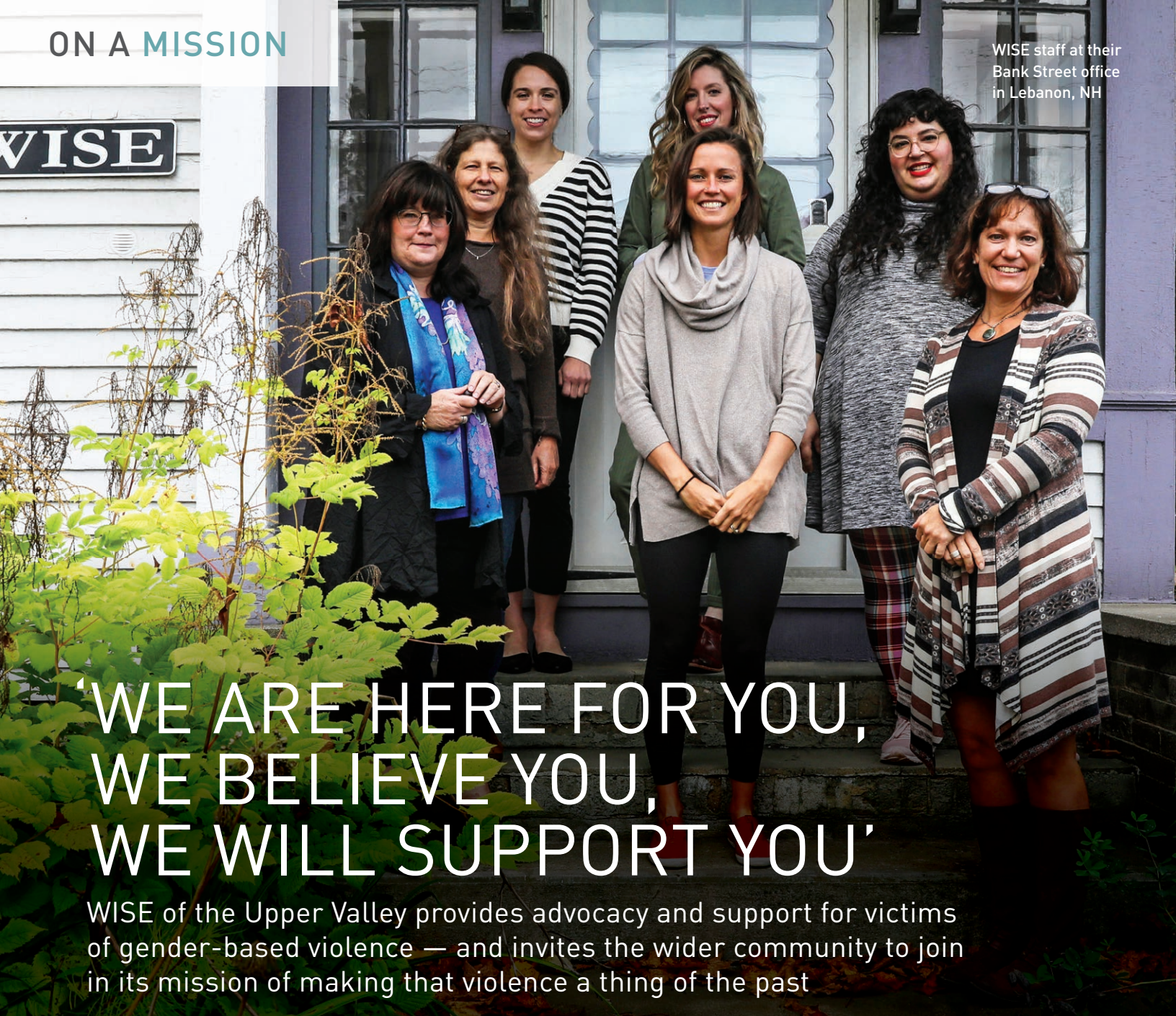
WISE staff at their Bank Street office in Lebanon, NH

‘WE ARE HERE FOR YOU, WE BELIEVE YOU, WE WILL SUPPORT YOU’