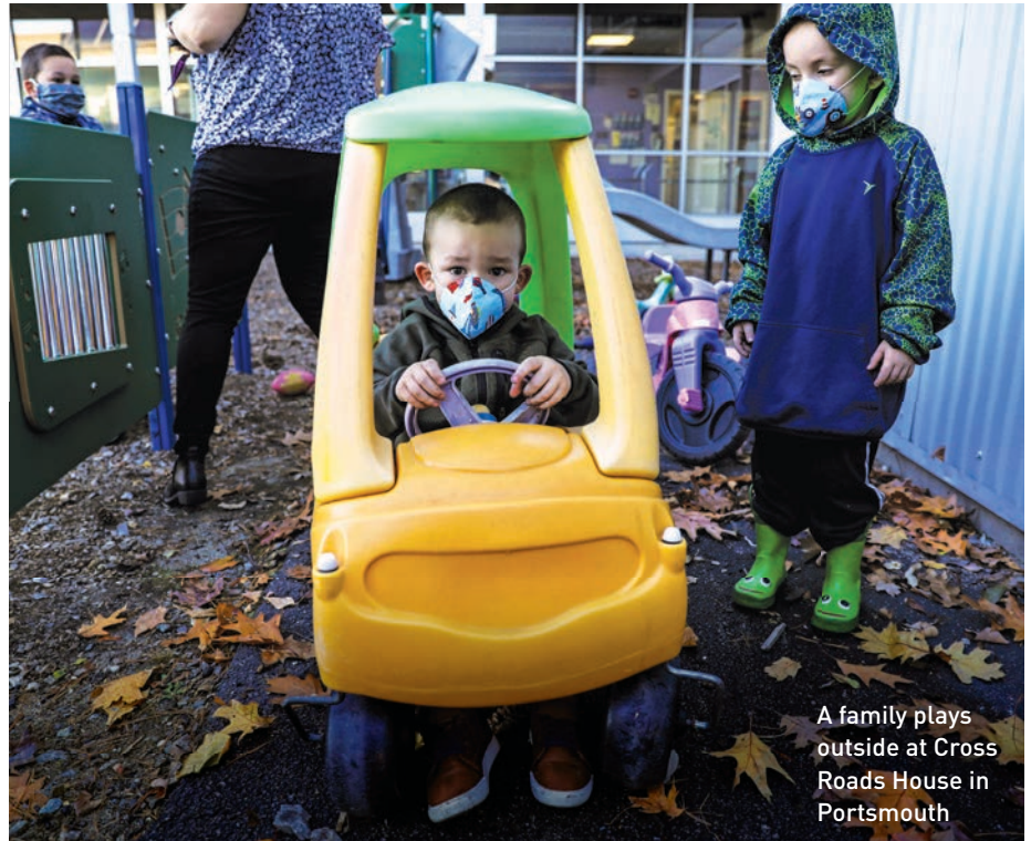
A family plays outside at Cross Roads House in Portsmouth

Across the state, nonprofit community health centers and recovery centers