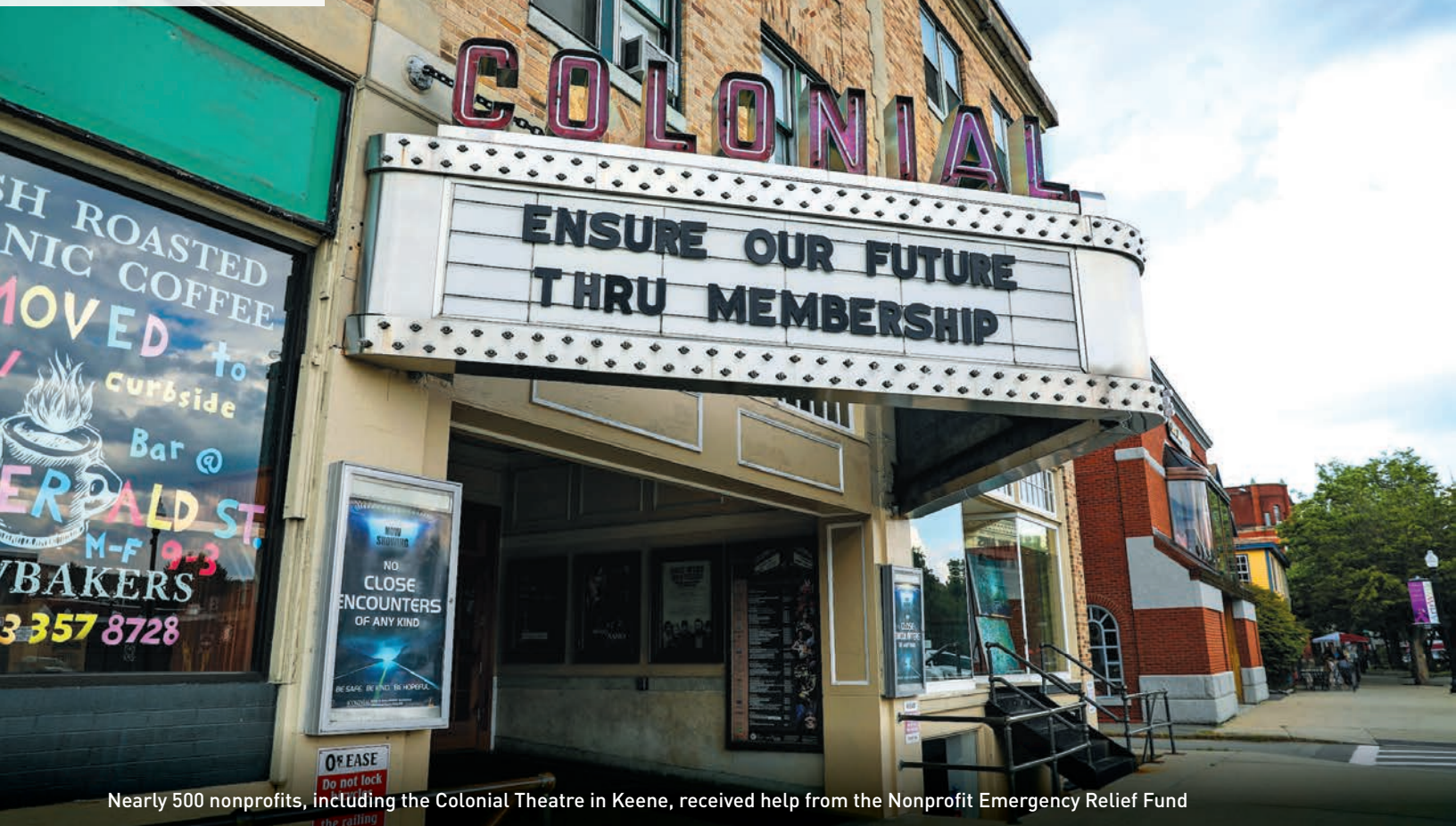
Nearly 500 nonprofits, including the Colonial Theatre in Keene, received help from the Nonprofit Emergency Relief Fund