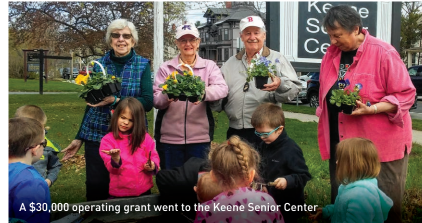
A $30,000 operating grant went to the Keene Senior Center