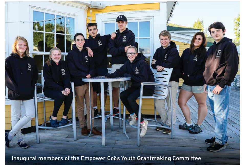
Inaugural members of the Empower Coös Youth Grantmaking Committee

The Charitable Foundation is by the people: Scores of residents help decide where the grants and scholarships go. The Foundation's eight regional advisory boards — 100 members in all — advise local grantmaking. An additional 24 people advise our New Hampshire Tomorrow initiative to increase youth opportunity, and 13 serve on our statewide board.