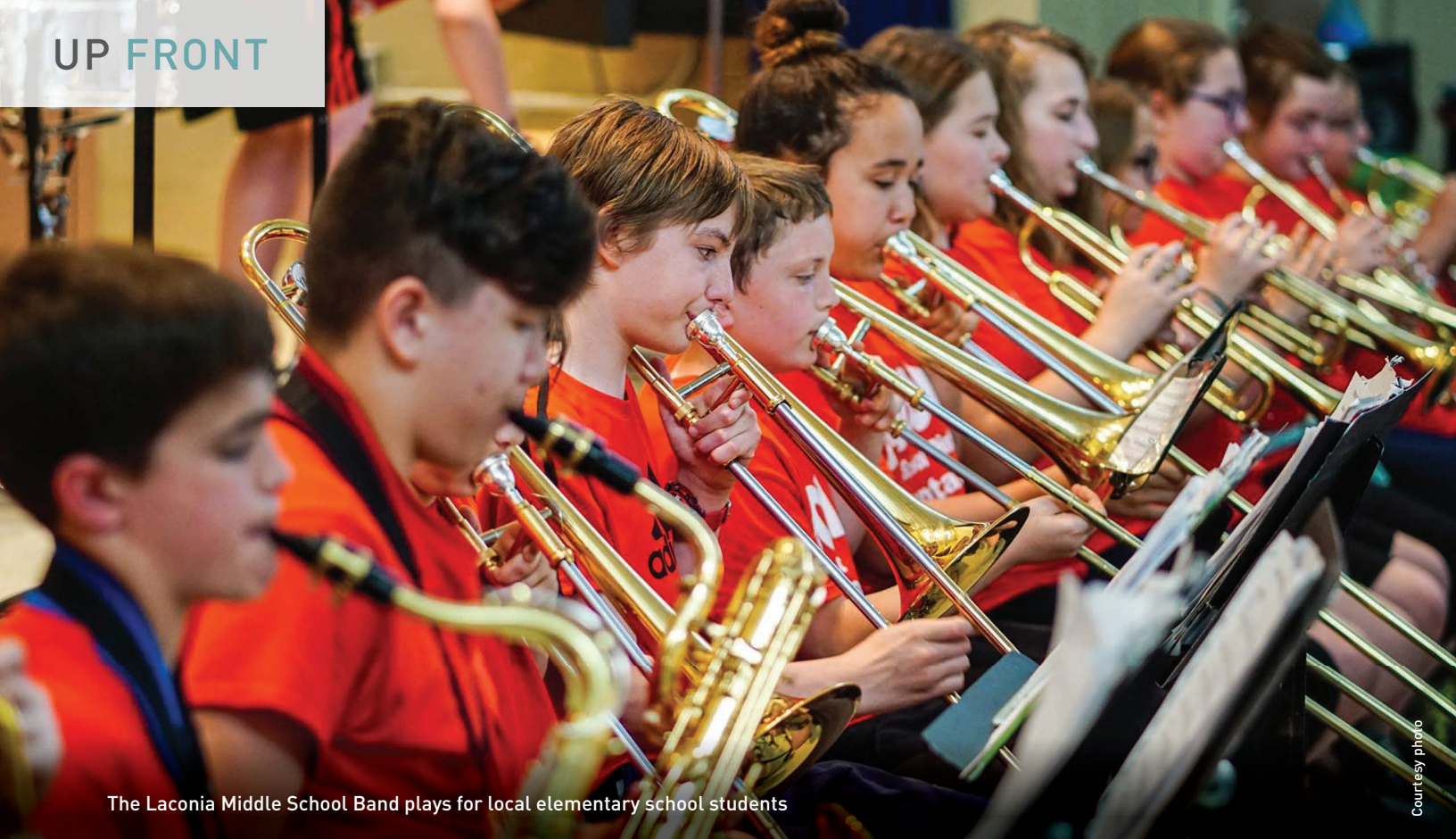
The Laconia Middle School Band plays for local elementary school students